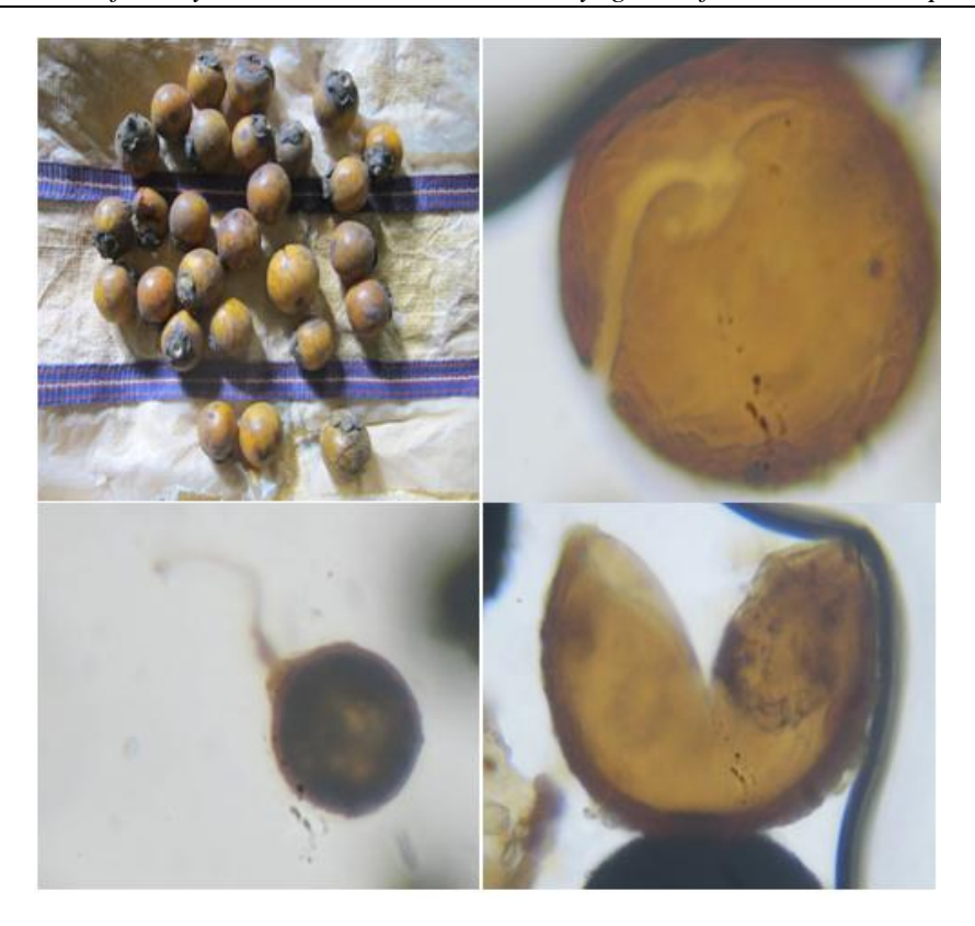
Figures 55-58: Upper left is Ripe Fruits of Diospyros tomentosa so called Kend, or Kendu (Santhals), as edible fruits, Upper right and lower two photographs are Vesicular Arbuscular Mycorrhizal (VAM) spores isolated from soil of Nayagram, Paschim Medinipur, West Bengal, may be used largely as bio-fertilizer in near future to develop the economy of local people and to restore the ecosystem in some extent to eliminate chemical fertilizers used there in a huge amount.