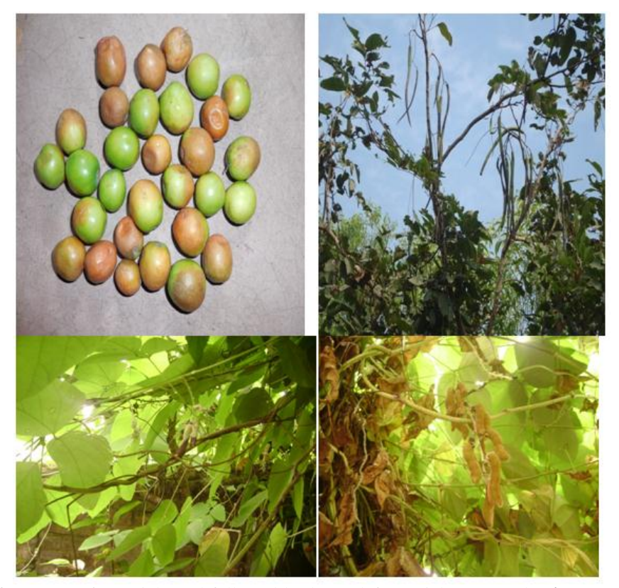
Figures: 41-44 (Upper Left to Right and followed by lower left to Right), Legend: Zizyphus jujuba, Cassia fistula, Mukuna pruriens (Flowering stage and Fruiting stage), the plants going to vanish day by day due to illegal operations knowingly or unknowingly in the forests of Nayagram where it was found common 10 years back from the present study. Note that now the same species is found common in hills of Panchet, Purulia, West Bengal, India. Seeds of the species like Mukuna is broadly used in laboratory to treat the Parkinson Disease.