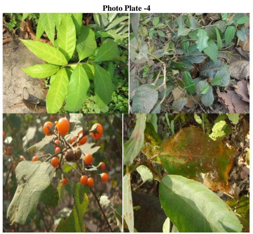
Figures 45-48: Lagerstroemia indica plant growing in an earthen pot to study the ecological behavior in insitu habitat, under varied microclimate at protected gardens, Paschim Medinipur, West Bengal, India.,