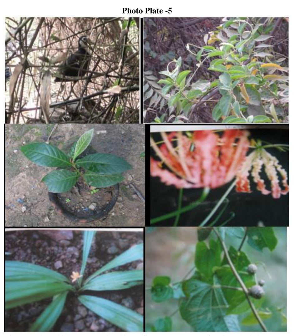
Figures 49 -54 : Bamboo thicket conserving birds, Gymnema sylvestris of Asclepiadaceae –an ant diabetic plant, Plant of Madhuca indica of Sapotaceae on earthen pot, Medicinal plant Gloriosa superba of Liliaceae, Curculigo orchioides (Talamuli-a medicinal plant), Dioscorea bulbifera of Dioscoreaceae (Medicinal Plant).

Aristolochia indica –The most promising interesting medicinal plants of lateritic southwest Bengal, facing serious threat day by day due to havoc collection by outsiders as this having good market demand. Fruits of Solanum trilobatum (Solanaceae) at the lower left and at the right putla plant ( Croton oblongifolius ) infested by red ants, the eggs are important Non Timber Forest Produce (NTFP/NWFP) and marketed in local hat (Weekly market), the local people used the same to stop hooping cough even to protect common cough is a source of organic acid.