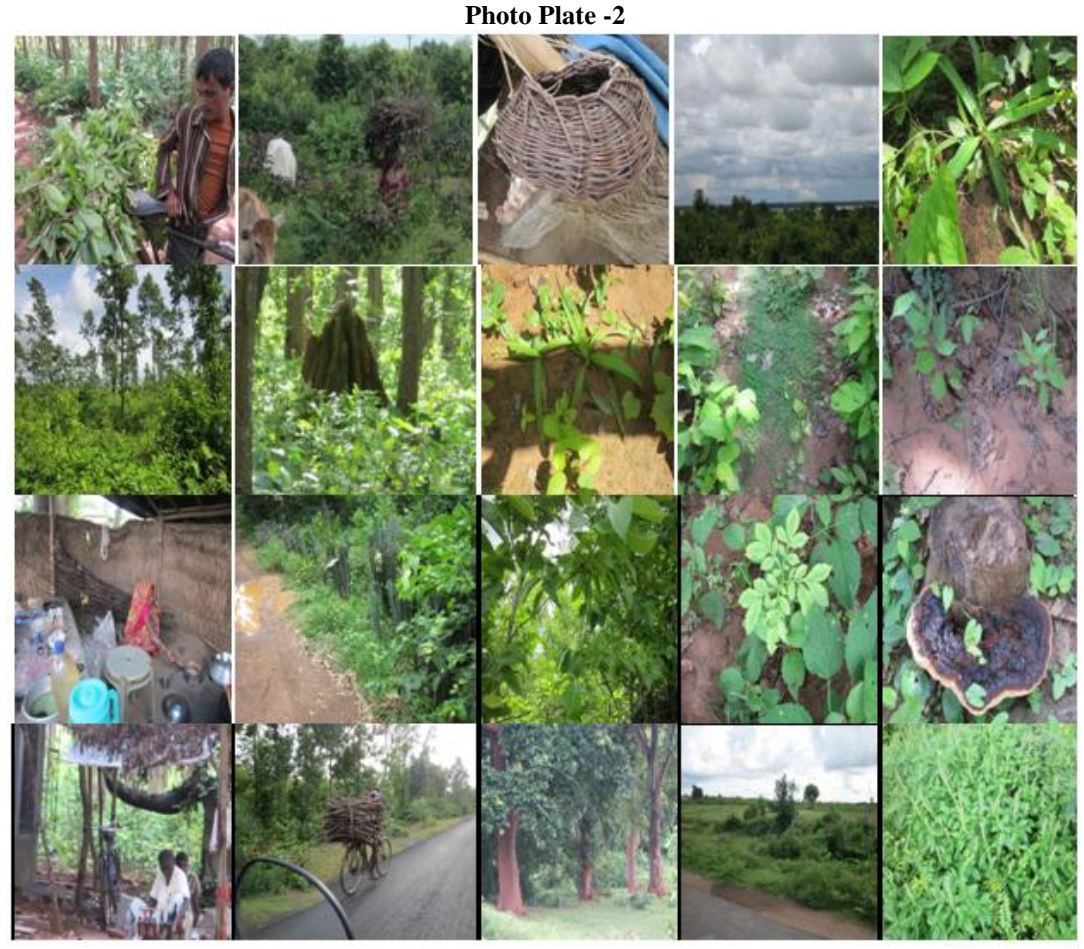
Figures: 21-40 (Upper Left to Right and followed by lower left to Right), Legend: 21-People collecting twigs of Glochidion lanceolarium for cattle feed; 22-Woman collecting fuel wood from forest; 23-Cotainer of fisher man made by Ichnocarpus frutescens stem (woody climber of forest); 24-Sal vegetation along the river bank near Kurchiboni village; 25-Safed musli in wild condition (Chlorophytum tuberosum); 26-Sal vegetation of coppice type (Coppiced during 2012, 2013), some mother plants are left untouched for producing propagule (Seeds) though they are largely coppice type: 27-Ant hill having ants causing litter decomposition during monsoon, 28-Plants of Curculigo orchioides -A most promising medicinal plant of the forest community; 29-Ground cover dominated by small herb like Desmodium triflorum ; 30-Young plants of Aristolochia indica ; 31-Local women using fuel of dry sal twigs collected from forest; 32-Cereus hexagonus in living fence; 33-Kurchi (Holarrhena pubescens); 34-Wild Arum-(Amorphophalus sylvatica); 35-Sal stump attacked by fungus (Polyporus shorae); 36-People consuming local wine made up of Mahul flowers in open place (Produced from Flowers of Madhuca indica); 37-People carrying wood for their fuel purpose; 38-Old sal trees reserved for seed production; 39-Degraded stand filled with Lantana camara and Eupatorium odoratum (Exotic species); 40-Wild roadside basil (Ocimum basilicum) dominated community along with co-dominant Ban-nil (Tephrosia purpurea) having potential to study VA-Mycorrhizal status in the lateritic forest area of West Bengal, India.