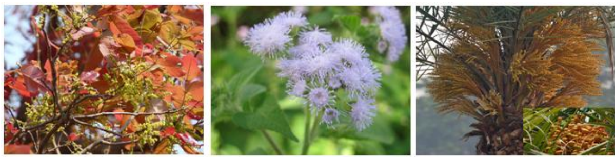
Fig 2a. Schleichera oleosa