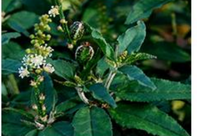
Fig 3c. Flacourtia Indica