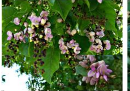
Fig 3a. Pongamia pinnata