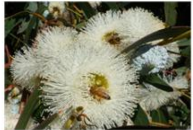
Fig 1a. Eucalyptus globulus