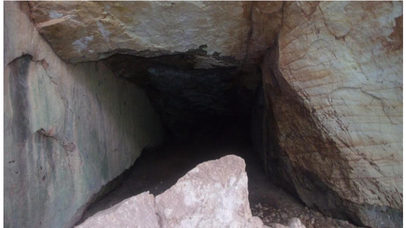
Plate 3: Front view of Ufuma cave

practices have stopped as a result of Christianity, some of the earthenware (ritual pots/plates) for this ritual are said to be hidden inside the cave. Plate 3 shows the front view of the cave.