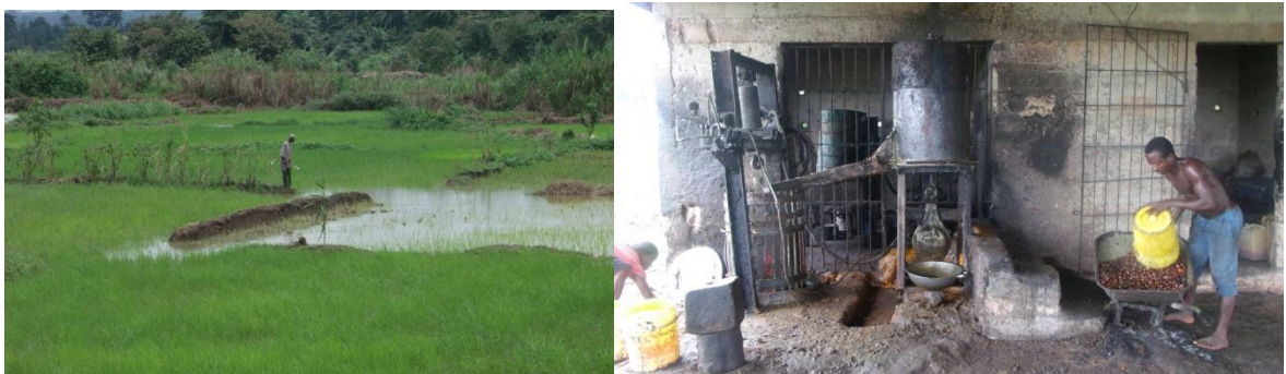
Plate 1: Rice field in Ufuma