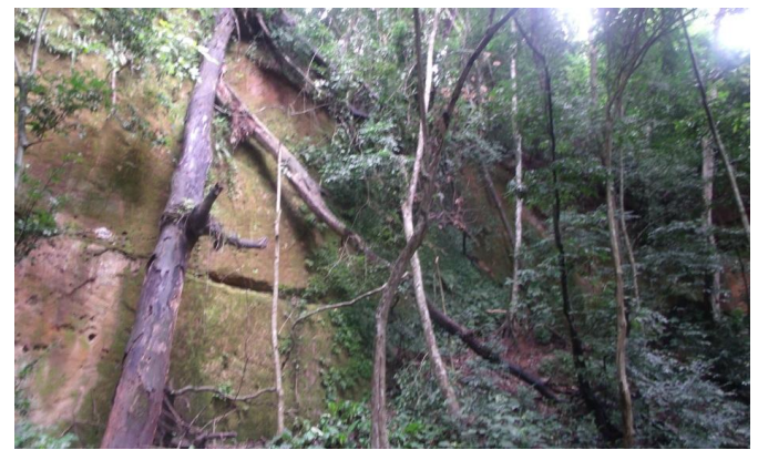
Plate 6: Showing untouched fallen logs of woods.

The forest surrounding this cave features economic trees like Ngwu (Albizia ferruguiea), Ube pear (Dacryode edilis), Ukpaka (Ricinus communis) Oji (Chlorophora excels), Egbu (Alastoniaboonei), Ukwa (Treculiaafricana), mango (Magnefera indica). There were lots of fallen logs of woods which are not tampered with (being fetch for fire wood, taken for sale) confirming that the people were not allowed to fetch firewood from the forest probably because of fear of the deity and dangerous animals there (See plate 6).