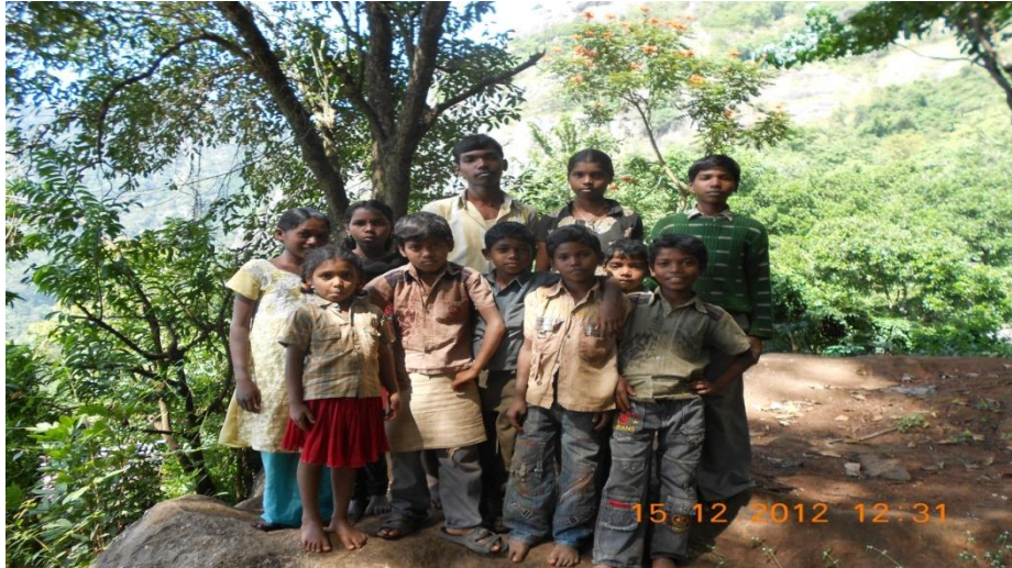
Few school going adolescents in the area