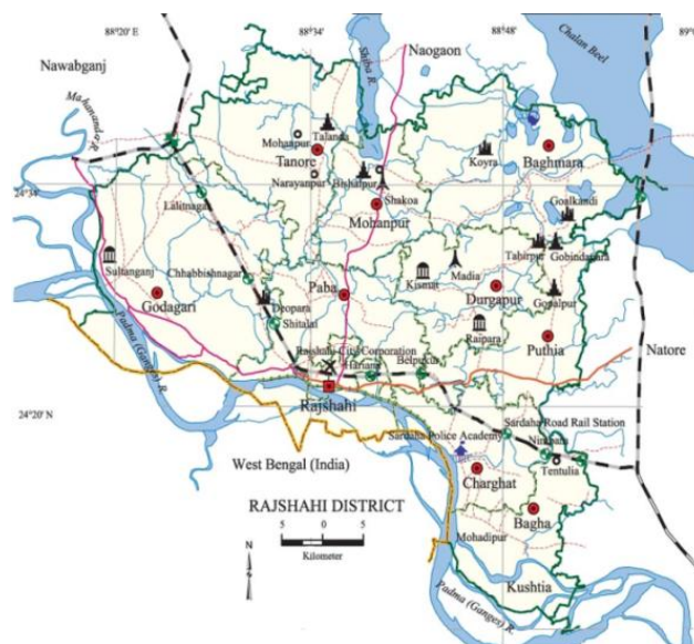
Figure 3.2.1 Map of Rajshahi District

The study was carried out in Rajshahi district of Bangladesh which lies between 24°07' and 24°43' north latitudes and in between 88°17' and 88°58' east longitudes. The total area of the district is 2,425.37 sq. km. Administratively the district consists of one City Corporation including 4 Metropolitan Thana and 9 Upazilla. The metropolitan thanas are Boalia, Rajpara, Motihar and Shah Makhdum and the upazillas are Bagha, Bagmara, Charghat, Durgapur, Godagari, Mohanpur, Paba, Puthia and Tanore.