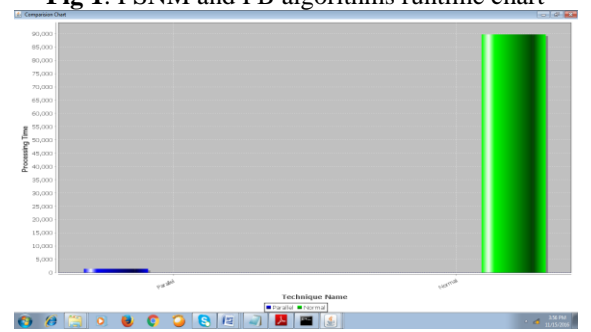
Figure 2. chart for parallel algorithm compare with PSNM, PB

Previous duplicate detection projects are implemented using PSNM and PB approaches. These are ranking approach based on candidate's comparison to find out possible duplicates. In contrast with this, in my project a framework is designed using parallel algorithm. This approach takes less execution time in an efficient manner. Exiting algorithms use candidate ranking approach where the duplication process depends on the search of all candidates without any elimination. The proposed system depends on the novel approach known as accurate concurrent candidate ranking approach. In this accurate concurrent candidate key approach suitable candidates are selected from the set of candidates, through the prediction process, which results to better accuracy while applying the process of identifying duplicate entries. Existing approaches are not fully progressive duplicate detection workflows, whereas the proposed model is a fully duplicate detection workflow model that seamlessly integrates with the existing measures.