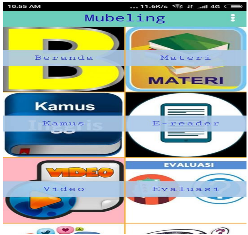
Figure 4.main menu on the application