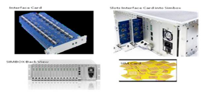
Fig. 2, Simbox and its components

SIM boxes are programmed to mimic the activities of a normal call user. The equipment can have SIM cards of different operators installed, so a single SIM box can operate with several GSM gateways located in different parts of the world. The availability of SIM cards at cheaper prices and the lack of law enforcement over the sale of prepaid SIM cards have also favored the growth of SIM box fraud. Figure 2 shows Simbox and its components.