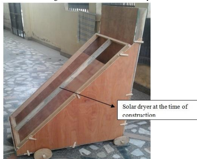
Fig. 2. Construction of solar dryer