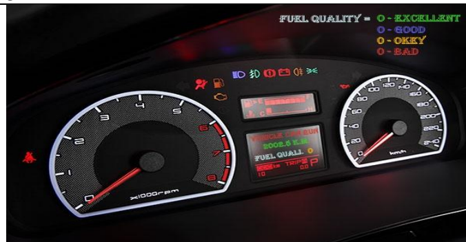
Fig. 1 modified type intelligent digital fuel indicator from reference no. [3]