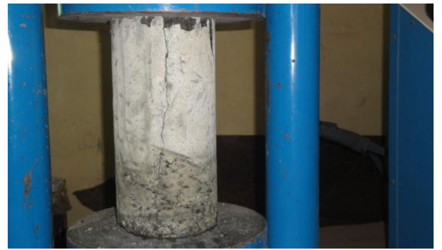
Fig .1 Compressive strength of cylinder load set up

Specimens were tested to determine the characteristic compressive strength of high strength concrete as per ASTM C -39/C39M - 99 The cylinders were loaded in a 200T compression testing machine at the rate of 0.3 N/mm<sup>2</sup>/s until failure as shown in Fig. 1. The results were tabulated as shown in Table No. 1, from the test results shows that the silica fume content increased, the compressive strength also increased gradually up to 9 percent silica fume replacement with cement content. The increased percentage of silica fume content demands more water and the slump value were also reduced. Fig. 2 shows the variation of silica fume content to compressive strength of concrete.