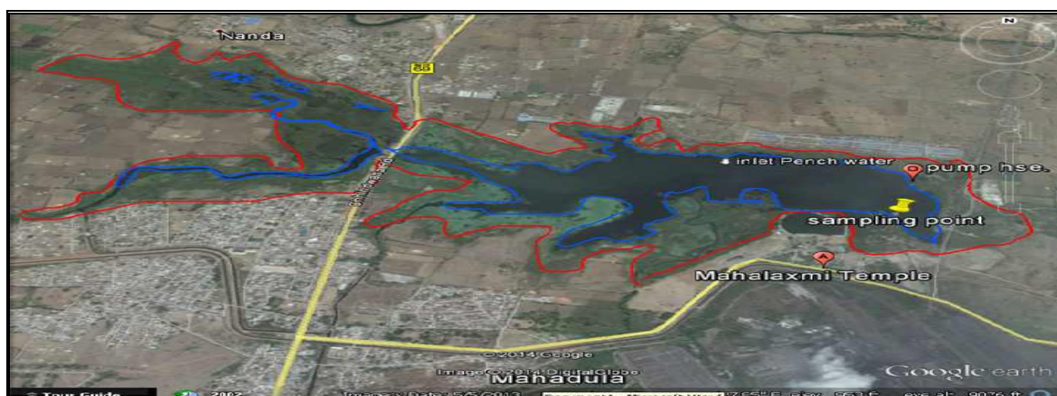
Figure 2.1 Aerial View of Koradi Lake

Samples were collected from the reservoir for the analysis of phytoplankton and zooplankton. The setup used for the collection of samples to analyze is as shown in figure. The samples were collected in 5 litres plastic cans from various sampling stations. The samples were filtered through 10 \mu\text{m} mesh. These samples were used for further analysis. Two drops of the collected sample was taken on a glass slide and was seen under microscope. The structure was identified and the no. of species was counted per slide.