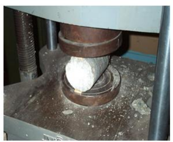
Fig.3 Split Tensile testing