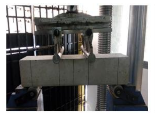
Fig.5 Flexural Strength testing