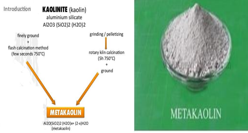
Fig.1 Formation of Matakaolin