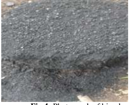
Fig 4: Photograph of bio-char