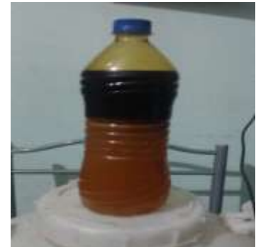
Fig. 2: Top bio-oil and bottom viscous liquid layers

The bio-oil obtained was dark in colour with a smoky smell and has a clear phase separation when stored in bottle as shown in figure 2. Bio-oil is separated and filtered from viscous liquid by density difference. Bio-oil finds its applications in boilers, turbines, furnaces and engines [5,6], production of chemicals [7], in agriculture etc.