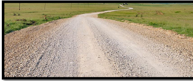
Figure.2 Rough Road (unpaved)