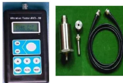
Figure.5 Accelerometer and transducer

In this study, the AVD-80 model MCM instrument and magnetic vibration transducer were employed for measuring seat vibrations as shown in figure 5. For specific details and specifications of the accelerometers and vibration meter, refer to Table 1.