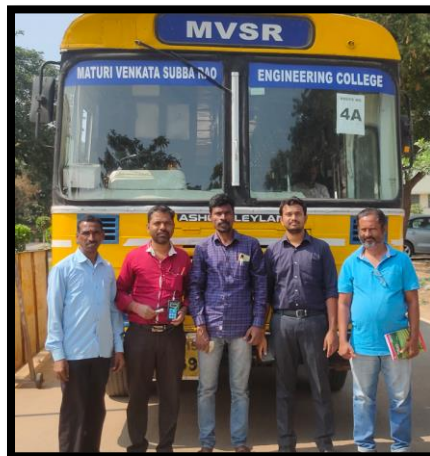
Figure. 4 Ashok Leyland vehicle

Public transport is a critical part of India's transportation system, offering affordable and accessible services to millions. This includes buses, trains, metros, and taxis, with buses being the most prevalent. India's market possesses numerous domestic and international vehicle brands like Ashok Leyland, Tata Motors, and Volvo Bus. In this study, the Ashok Leyland bus was chosen for evaluation as shown in figure 4.