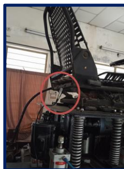
Figure. 6 Placement of accelerometer transducer

The data collection process was extended systematically, with tests conducted on smooth, rough, and bumpy roads with speeds of 40 km/h, 20 km/h, and 10 km/h, respectively.