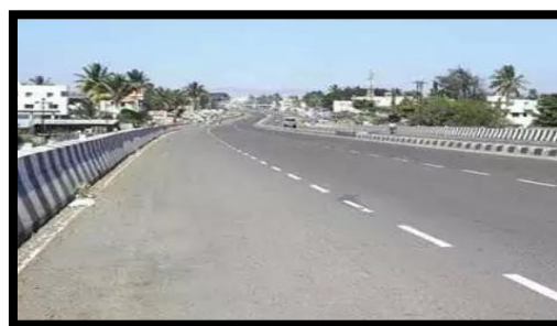
Figure. Error! No text of specified style in document. 1 Smooth Road(highway)

Highways are top-tier roads with smooth surfaces, no potholes, or ditches. They link major urban centers, minimize bumps, suit all vehicle types, and endure heavy loads with little deformation as shown in figure 1.