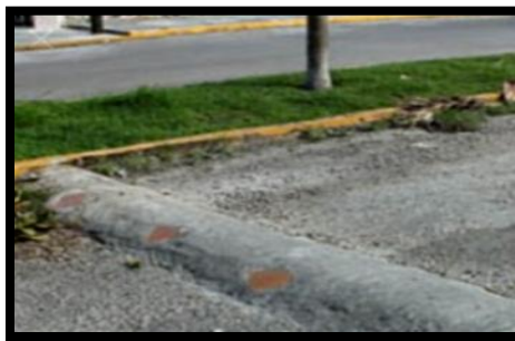
Figure.3 Bump Road (speed breaker)

A speed breaker, or speed hump, is a road feature designed to slow down vehicles and enhance road safety. Typically constructed from materials like asphalt, concrete, or rubber, it's positioned perpendicular to traffic flow (see Figure 3).