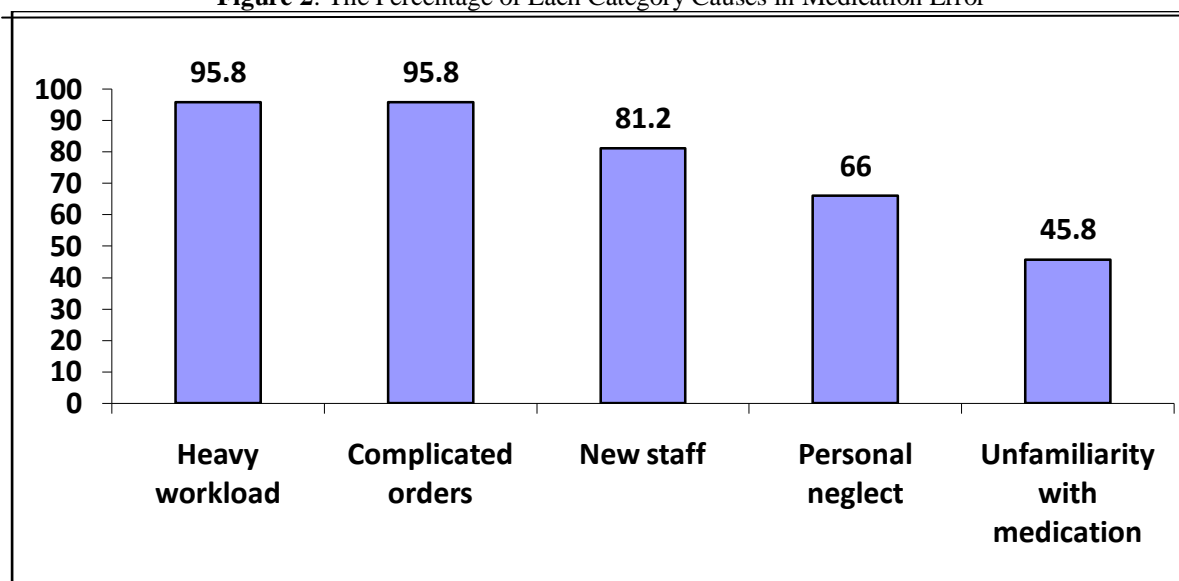
Figure 2: The Percentage of Each Category Causes in Medication Error

Fig.2 showed the percentage of each category (n=48) selected as contributing to the medication error among nurses. Heavy workload and complicated orders 95.8% (n=46), A both category as higher causes then follow by percentage New staff 81.2 % (n=39) and personal neglected 66% (n=31). There are three common categories selected as contributing error. Others factor is unfamiliarity with medication 45.8% (n=22) which also need to solve problem causes the factor are.