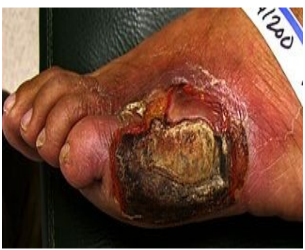
Figure 2 Foot ulcers are a common complication of diabetes and can lead to amputation. This ulcer is further complicated by both wet and dry gangrene.