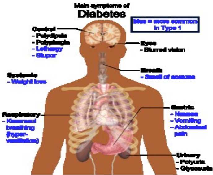
Figure 3 Overview of the most significant symptoms of diabetes