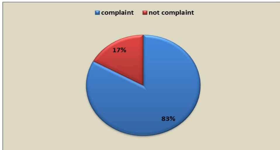
Fig. (1) Distribution of the study sample according to their complaint of heartburning. Fig. 1 shows that most the sample (83%) complain of heartburn during third trimester of pregnancy.