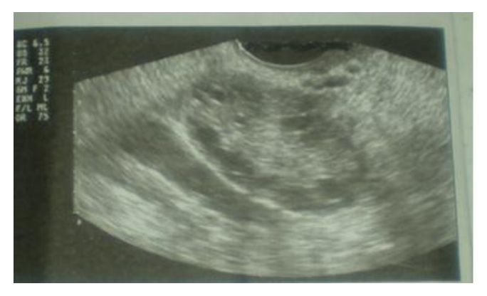
Fig-5-Ultrasonogram of a middle aged woman showing multiple cysts in the liver