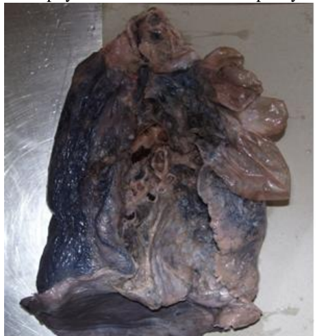
Fig-1- Left lung showing the presence of Emphysematus bullae and multiple cysts