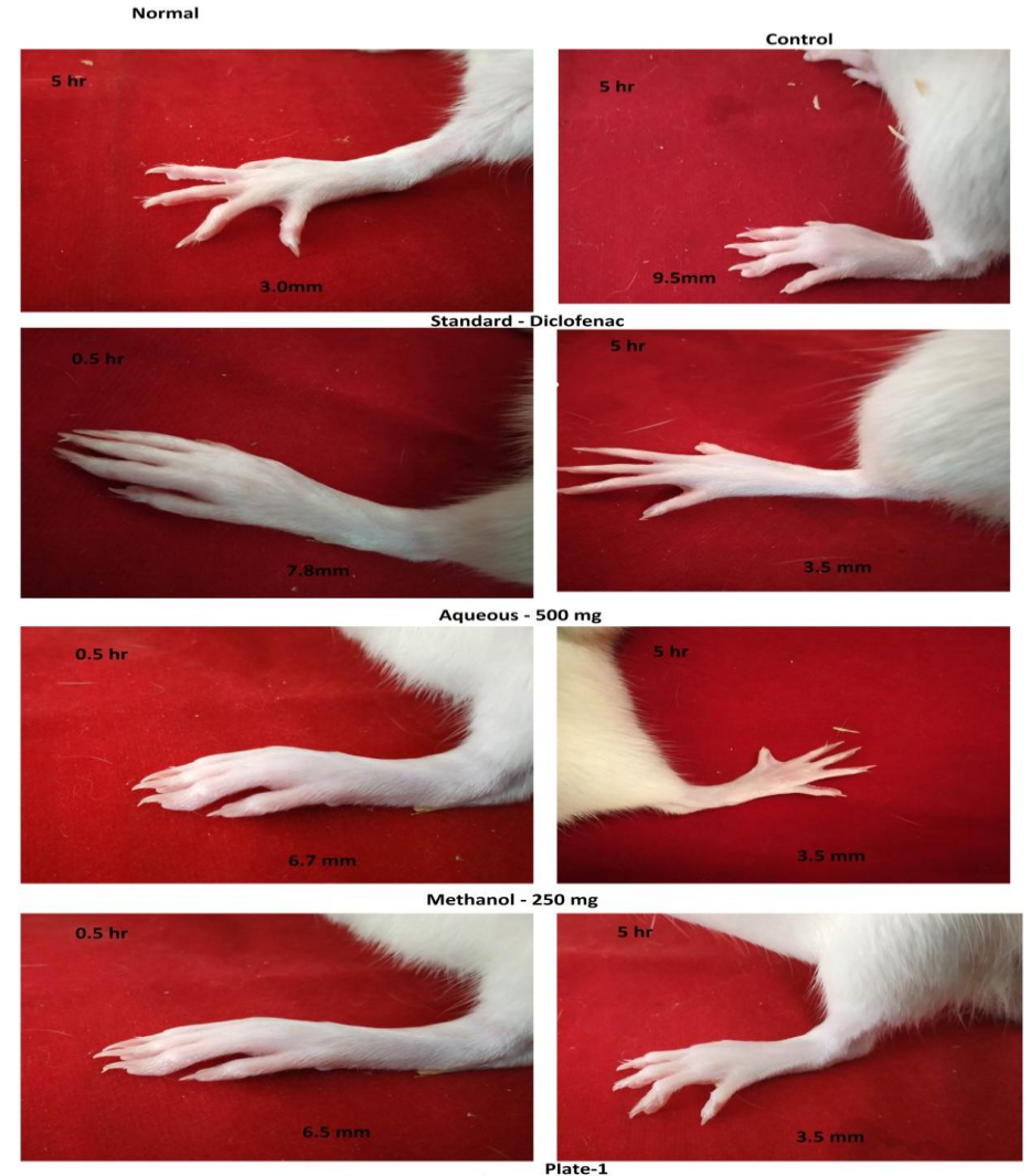
Anti- inflammatory Activity of Dioscorea oppositifolia L.tuber extracts

Anti-inflammatory Activity: Carrageenan induced rat paw oedema was reduced by the methanol extracts at 250 mg/kg b.wt more effectively than aqueous extracts compared to the standard drug Diclofenac at 100 mg/kg b.wt. The most effective activity observed with tuber methanol at 250 mg/kg b.wt showed equal activity to that of diclofenac with 63.15% of inhibition of inflammation (Table-3; Plate-1).