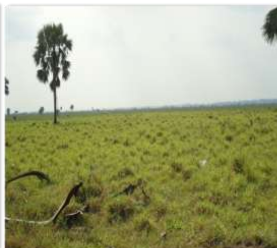
Figure 3 : Brachiara brizenta Figure 4 : Brachiara omidicola