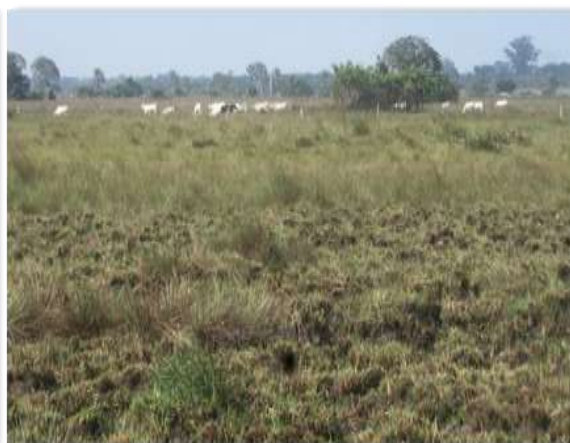
Figure 2: Natural pasture on dry land