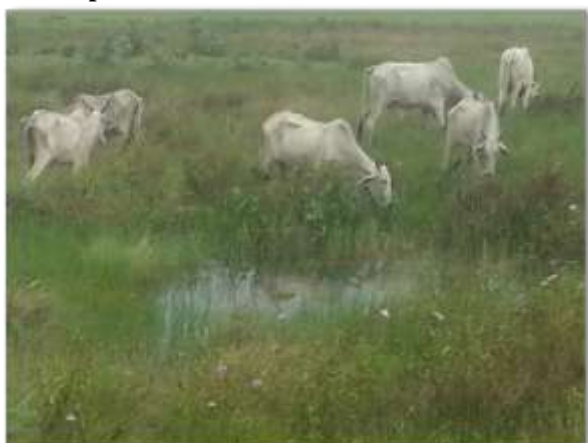
Figure 1: Natural pasture in flooded areas