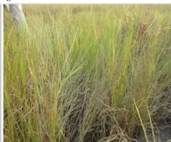
Figure 5 : Panicum Massaye Figure 6 : Bracharia Laneiro

Prophylaxis: The animals are regularly dewormed and treated with trypanocides. They are vaccinated against pasteurellosis and contagious bovine pleuropneumonia and are screened for brucellosis and tuberculosis. The herds are natural and the breeding bulls are kept there permanently.