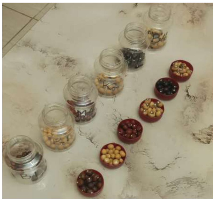
Figure 2. The seed testa pattern and seed testacolour of the six Bambara groundnut germplasm used in the study.