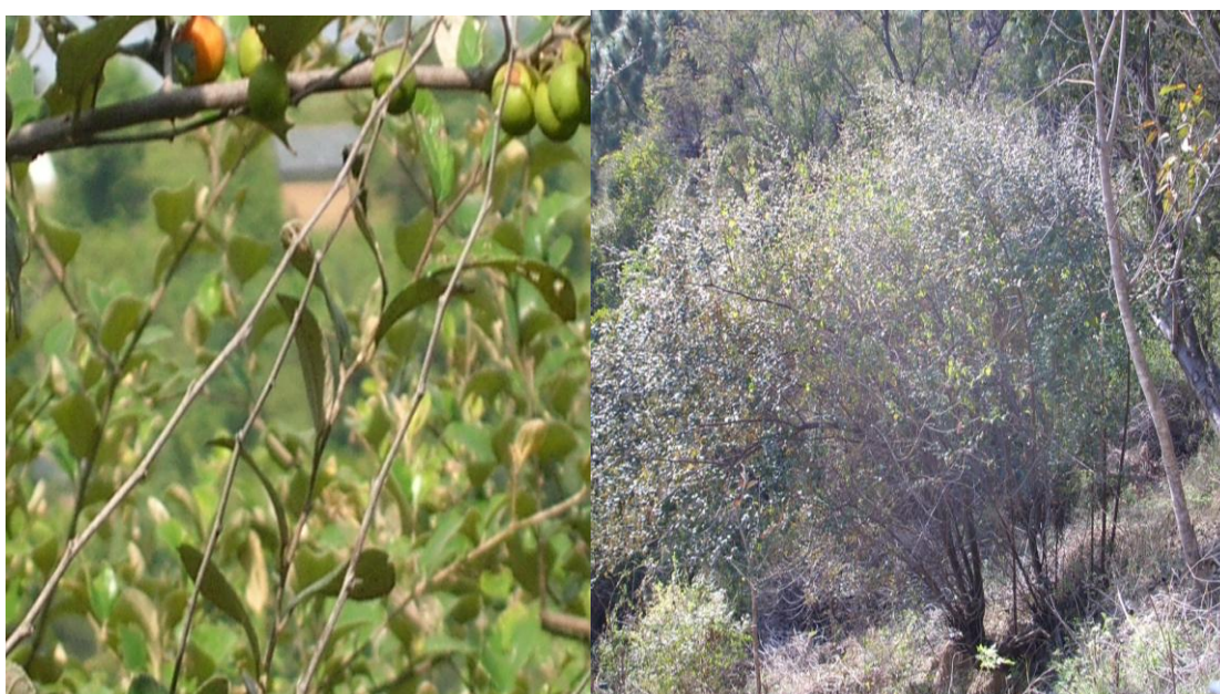
Zizyphus jujuba Mill. Showing Fruits, Habitat and Habit.