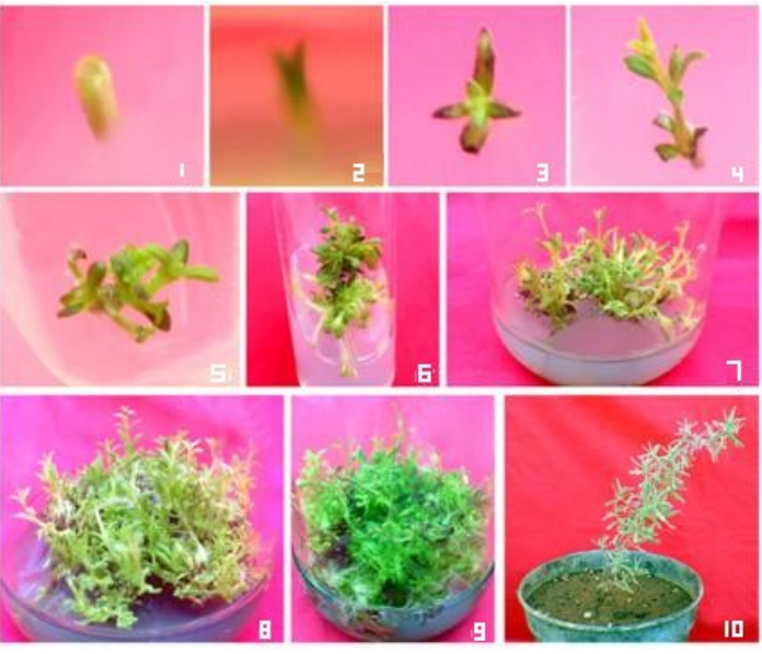
V. Table 1: Effect Of Different Concentrations Of Growth Regulators For Initiation And Multiplication Of Shoots From In Vitro Apical Bud Explant Of Lavandula Angustifolia