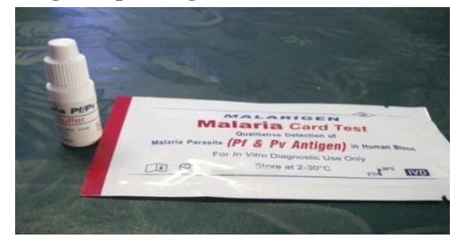
Picture1:Malarigen card RDT with buffer solution

At least 100 high power fields were examined before reporting as No Parasites Found (NPF). II.IV.IV Diagnosis of malaria using a Rapid diagnostic Test (RDT)