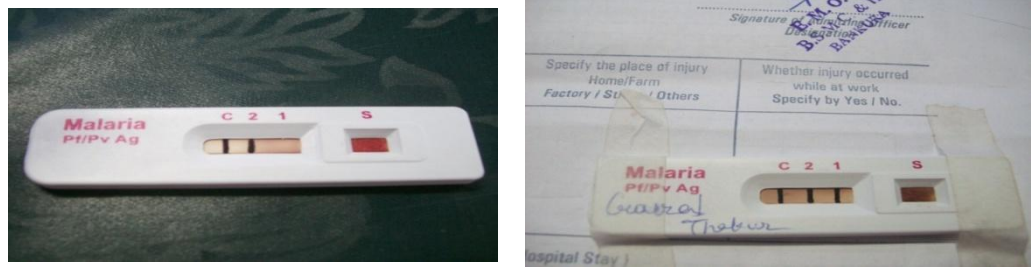
Picture 2.RDT positivity for P.vivax(left) and P.falciparum(right) by Malarigen card test