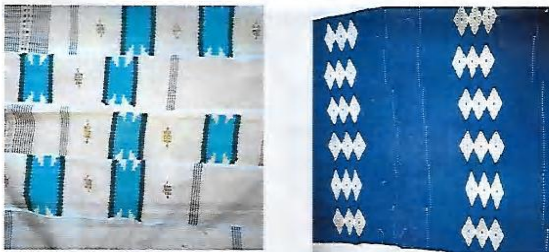
Fig 8: Some Samples of Contemporary Aso-oke on Display

Indication from the various sources of materials used in the production of indigenous woven cloth (Aso-oke) would suggest combined contribution of the services of artisans such as farmers-Cotton growers, cassava/gari producers as well as paint producers. [11] opines that, the concept of economy is that it embraces all aspect of human endeavour where resources optimization is involved. National economy can be placed within this concept as maximization of all aspect of national resources is in relation to human input on material resources. While the involvement in vocational and technical skill of weaving traditional cloth (Aso-oke) not only represents an economic develop for the nation but has also maximize the use of cotton, leaves and planks as all products of human capacities. [12], asserts that there are links between individual surviving options that will increase human capital development on one hand, and also create essential goods that will necessarily promote their well-being, harmony and growth of the society and nation on the other hand.