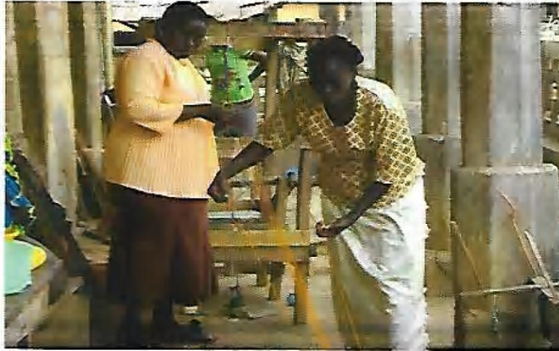
Fig 6: Draw in Warp Yarns on the Horizontal Loom

This is the process whereby the yarns are drawn or set on the loom to get ready for weaving (Fig 6). After setting it, upper and lower layers must be formed to give two separate sheds. It is inside this two separate sheds that the weft yarns would pass through in an alternate manner to create the fabric (Fig 7).