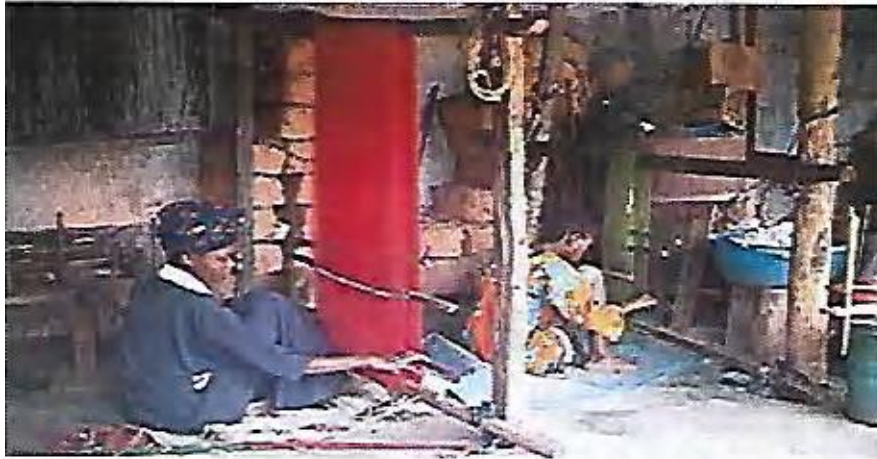
Fig. 1: Single Heddle Loom (Vertical)

two major types of Kijipa. The first one is of blue-black colour commonly used by women. The second type is of pure white or creamy white colour preferred by men. Kijipa is mainly used for manual work because it is very thick and does not tear easily. An average Yoruba man that wants to go to the farm or do any vigorous work would prefer to wear Kijipa to do the work, because the cloth is strong and durable.