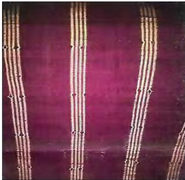
Fig 4-: Alaari Hand Woven Cloth, spun cotton, 79cm/62cm, 1954.

Alaari cloth (Fig 4) is crimson in colour. It is traditionally woven with, locally spun silk yarns dyed in red camwood solution to achieve permanence in colour fastness. The use of Alaari is not limited to a particular ceremony but traditionally used for all events among the Yoruba people.