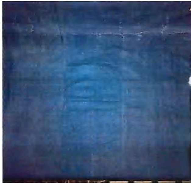
Fig 3-: Etu Hand Woven Cloth, spun cotton, 79cm/62cm, 1952.

and stretching. In ancient times, Etu is used as important social dress by chiefs, elders and traditional royal kings among the Yoruba. The second type of Etu is PETUJE: it is just like Etu” cloth but the colour is lighter when compared with the deep blue colour of “Etu” cloth. Etu was first woven before the introduction of Petuje, a lighter colour of Etu as may be requested by some people.