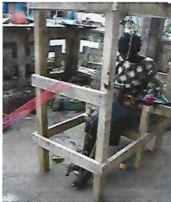
Fig. 2 Horizontal Loom: - 138cm/79cm/ 154cm,

The double heddle loom used by men is a horizontal loom with unwoven warp yarns stretched out several metres in front of the weaver with heavy stone or heavy metal to maintain tension. The loom produces strips of woven fabrics, which is about 14cm-15cm wide. The fabrics are cut and the selvages stitched together to make a larger piece of cloth which could be used for clothing or coverings.