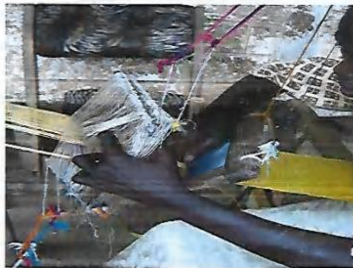
Fig. 7: Passing the Warp Yarns through the Heddle and the Reed on the Horizontal Loom in an alternate manner.