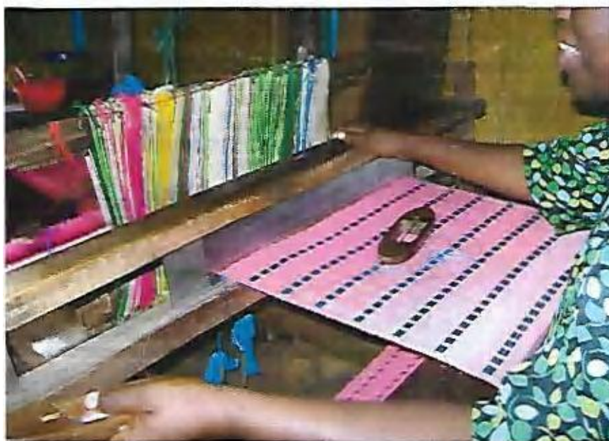
Fig 9:- Broad Loom.

To make hand woven cloths to compete more favourably with electronically driven woven machine, broad woven loom (Fig 9) is now adopted which can weave up to 26 inches wide fabric. Fewer strips of it are needed to make a complete outfit/attire, as against several strips made on the horizontal narrow loom.