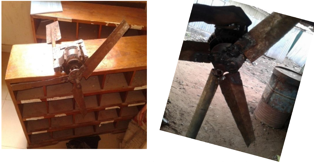
Figure 5: Coupled Alternator, Turbine, Frame and Galvanized Pole

Alternator connected to the blade with the tail was tighten with two 17 spanner size bolt & nut of 10 mm tap thread, which hold tight the alternator connected to the blade with the tail together with the galvanized steel pipe stand.