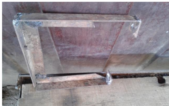
Figure. 3: Alternator Frame (3-angle bar steel)

The frame made up of 3-angle bar steel, which was cut in three different lengths (top breadth 6.7 inch, base breadth 6.2 inch and height 7.8 inch), was welded together joint to joint of the three joint firmly with gauge 12 electrode. This is shown in Figure 3. There was a need to use the square bar to check if the 3-angle bar is perfectly square. This will make the angles to be at 90° to one another, before securing a permanent welding.