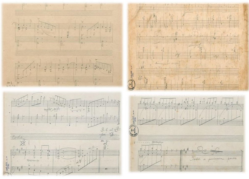
Figure 2 - Scores of choreography

Continuing on, below in figure 3 it is possible to observe the labanotation method being used in waltzes, found in the register in the national digital library, here it is possible to prove the existence of choreographies registered and protected by the copyright law, and it is also possible to establish a path for recording and protecting training sessions.